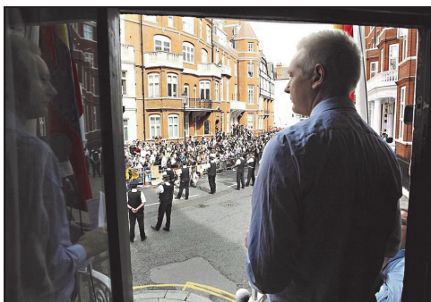
Julian Assange, Australian journalist, founder of Wikileaks, more than a year and a half has been actually holding in detention inside the Embassy of Ecuador that had granted him a political asylum (London, August 19, 2012).

According to the information published in November in the German magazine Der Spiegel with reference to the data provided by Edward Snowden , GCHQ had been monitoring hotel bookings in more than 350 hotels around the world in order to know the hotels where foreign diplomats and members of governmental delegations stayed during their visits. The Headquarters' specialists could wiretap the hotel room telephone, computer which the surveillance object used. A special program « Royal Concierge » was elaborated in order to monitor online bookings. The secret service agents could also place diplomats and foreign