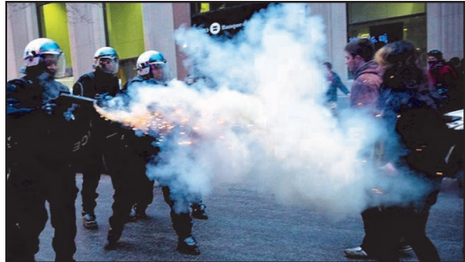
The police used pepper spray to crackdown the protest against police brutality (Montreal, March 15, 2013).

April 6, 2013 Montreal: over 1,000 people took part in a demonstration against the disproportional use of force by police. 279 demonstrators were arrested.