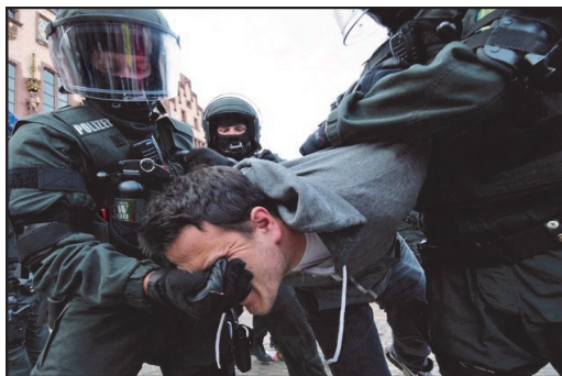
Arrest of the participators of the protest «Blockupy Frankfurt» (Frankfurt, June 1, 2013).

Germany was strongly criticized during the second cycle of the Universal Periodic Review in the UN Human Rights Council in April 2013 due to the excessive use of force by law enforcement officials and the use of special measure towards protesters, violation of rights to peaceful assembly and freedom of expression, tortures and other forms of cruel treatment against protesters, as well as absence of specific legislation pertaining to criminal punishment for torture.