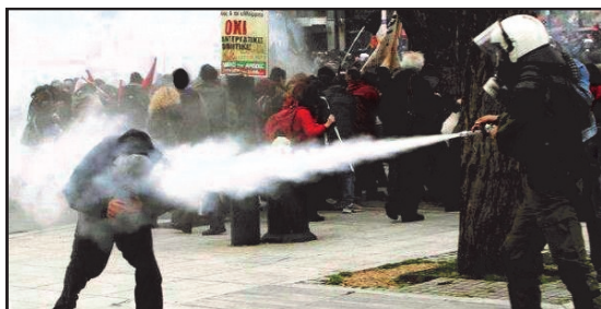
The police used tear gas to disperse the protesters (Chalkidiki peninsular, March 7, 2013).

The Committee against Torture in its concluding observations on the 5th and 6th periodic reports of Greece (May 2012) expressed serious concern at the lack of an effective independent system to investigate complaints of torture, ill-treatment or excessive use of force, as well as to the continuing inspections of body cavities in the places of detention.