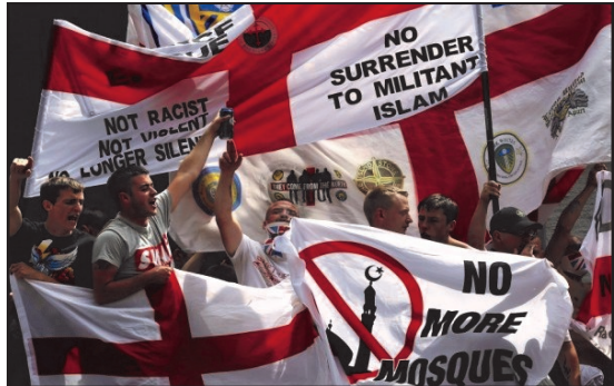
Supporters of the English Defense League take part in the anti-Muslim demonstration (Birmingham, July 20, 2013).

September 07, 2013, London: about 500 people participated in the nationalist rally shouting anti-Muslim slogans. They were opposed by several thousands of anti-Nazis. About 150 people were detained.