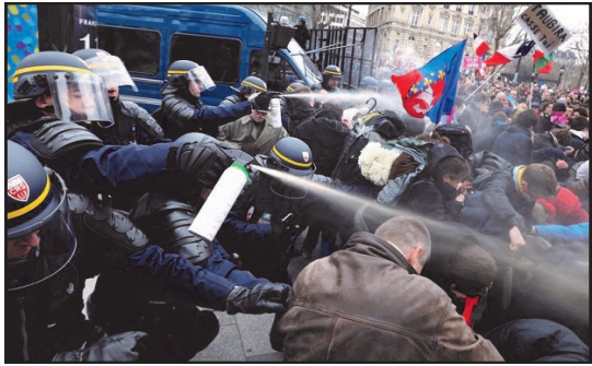
The police used tear gas to disperse the protesters (Paris, March 25, 2013).

March 24 – 27, 2013 Paris: about 1,4 mln participants protested against same-sex marriages and granting to same-sex couples the right to adopt children. The police used tear gas and batons to disperse the protesters. About 100 people were arrested. Several protesters were injured.