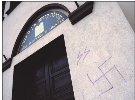
A desecrated synagogue (Gdansk, November 4, 2013).