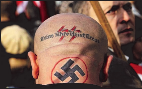
The Jobbik party supporter takes part in the anti-Semitic demonstration. There are Nazi swastika and Waffen SS motto «My Honor is Loyalty» on the tattoo (Budapest, May 4, 2013).

May 4, 2013 Budapest: the far-right party Jobbik ( The Movement for a Better Hungary ), that is the third political force in the country and has 15 percent of seats in the Parliament, held an anti-Semitic demonstration «in commemoration of the victims of Bolshevism and Zionism». The demonstration was timed to the World Jewish Congress.