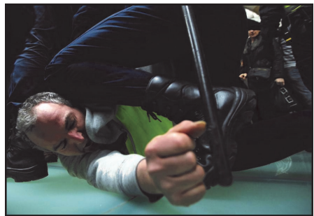
Арест участника забастовки в аэропорту Бархас (Мадрид, 19.02.2013).

December 15, 2013 Madrid: the police dispersed demonstration of many thousands against the draft law on public safety and cutbacks to public services toughen sanctions for public order violations during public rallies. At least 7 persons were arrested.