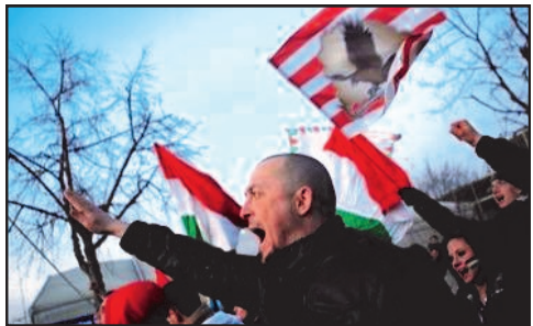
Far-right football fans chanting Nazi salute «Sieg Heil!» (Budapest, April 29, 2013).

April 29, 2013 Budapest: on the eve of the World Jewish Congress Ferenc Orosz, Chairman of Raoul Wallenberg Association , was attacked by football fans who cried out Nazi salute Sieg Heil!