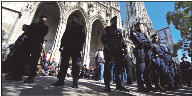
The police surrounded the Votivkirche church building just before the crack down of the protest (Vienna, September 22, 2013).

liberty are reportedly overcrowded and juveniles are not always separated from adult prisoners, as well as about the limited access to adequate health care.