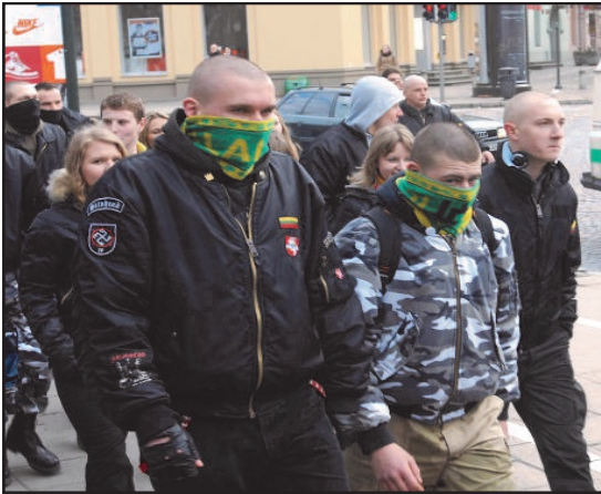
Lithuanian neo-Nazis took part in the march (Vilnius, March 11, 2013).