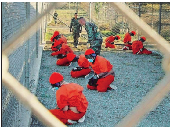
Evidence of Torture in Guantanamo Bay detention camp.

13.04.2013 The detainees claimed that the detention camp authorities used tear gas and rubber bullets in response to the attempts of the detainees to prevent video surveillance in the cells.