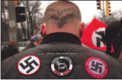
A supporter of Nazi organizations takes part in the anti-refugees protest (Berlin, Marzahn Hellersdorf August 28, 2013).

The participants of those actions chanted racist slogans and demonstrated Nazi salutes to refugees.