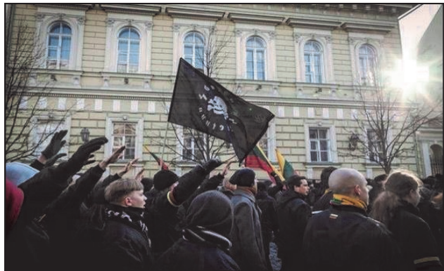
Participants of the march demonstrate Nazi salute (Vilnius, March 11, 2013).

According to the findings of the international movement World without Nazism, neo-Nazis manifestations in Lithuania became the most widespread form of street celebrations.