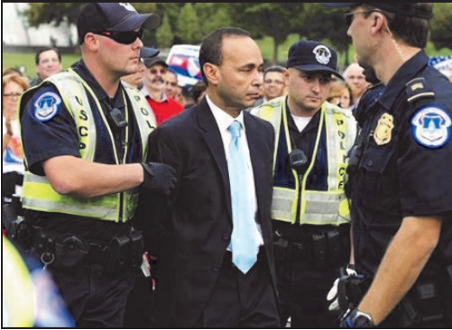
Luis Gutierrez is arrested by U.S. Capitol Police officers on Capitol Hill during a immigration rally (Washington, October 8, 2013).

October 8, 2013 Washington, DC: 200 people, including eight Democratic members of the House of Representatives were arrested during a massive rally seeking to push Republicans to hold a vote on an immigration reform bill and to pass it.