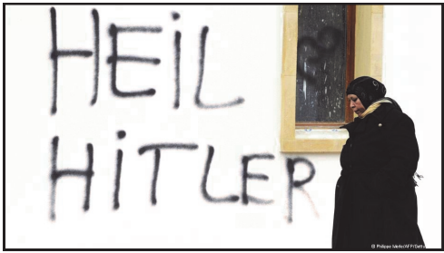
Right-wing extremism is on the rise in the Czech Republic

Segregation of Roma children continues in the Czech Republic. Disproportionally large number of Roma children are placed into sub-standard schools with simplified curricular for mildly disabled children or for children showing poor progress. There are also schools segregating Roma children from their schoolmates of other nationalities.