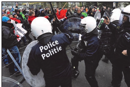
Crackdown of the protest of ArcelorMittal workers (Brussels, January 25, 2013).

According to the statistics of the Standing Police Monitoring Committee , known as Committee P , published by the newspaper Le Soir in February 2013 the number of complaints against police is constantly growing (2405 in 2009, 2451 in 2010, 2688 in 2011) despite the simplified methodology of their recording (previously an investigation was conducted on each complaint, currently a case is open only if numerous complaints refer to the same incident). One-quarter of all complaints concerns the use of force (beating) by police officers. In 2010, only 11 law enforcement officials were found guilty of beating and degrading treatment of victims.