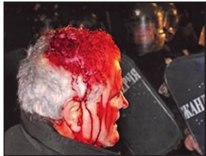
Victim of the protest crackdown (Sofia, January 25, 2013).

According to the research of the Association of European Journalists (June 2013), 46 percent of Bulgarian journalists were subjected to pressure. 60 percent of television journalist, 48 percent of printed media journalists and 40 percent of Internet media journalists experienced the pressure. 48 percent of all respondents stated, that the pressure on the media became systematic and regular practice.