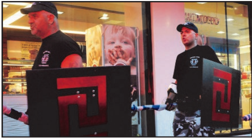
Members of the extreme-right Golden Dawn party hold shields with their party symbol (Athens, May 26, 2013).

The Committee against Torture in its concluding observations on the 5th and 6th periodic reports of Greece (May 2012) expressed serious concern about the allegations pertaining to ill-treatment of the undocumented migrants, asylum seekers and Roma by the law enforcement officers including in detention facilities and in the context of regular police checks in the streets, as well as the increase in manifestations of xenophobic and racist attacks against foreign nationals, irrespective of their status, including by citizens' groups and far-right groups.